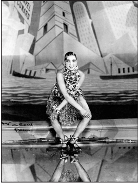
Josephine Baker performing the Charleston